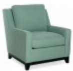
SKU 1485 Carter